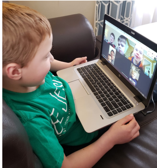
SJV Kindergartners Learn and Stay Connected with Our St. John Vianney School's Virtual Learning!

NOTE: The Curé d'Ars School Annual Fund is used exclusively for Technology, Top Teacher Talent & Tuition Assistance.