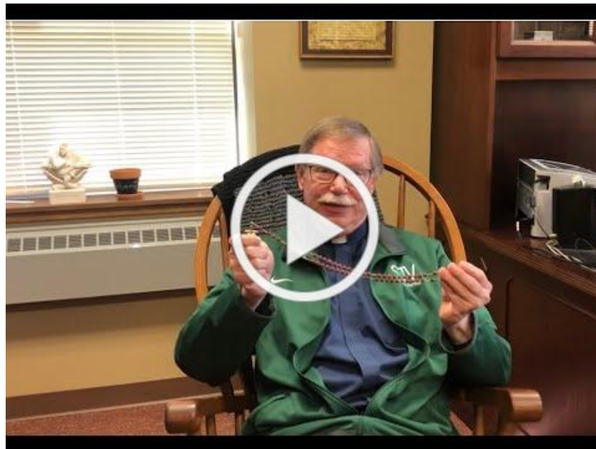
Faith at Home::May 19, 2020