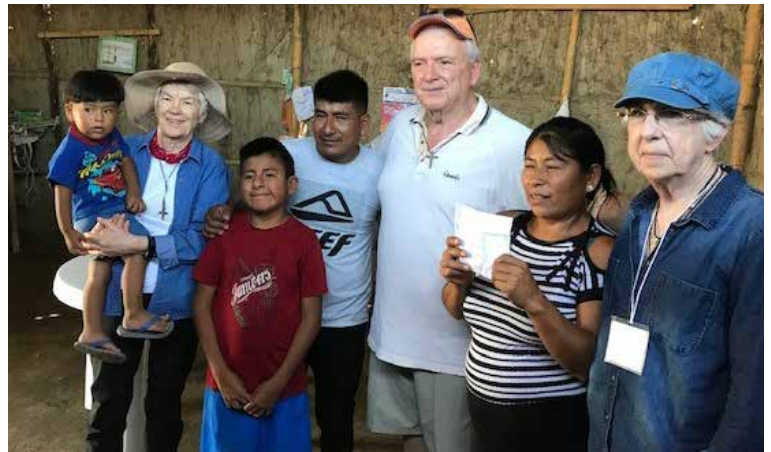
Peru Family to Family connections are life changing for all!

Help build a sister relationship with our twinning parish, Prince of Peace. Many activities have been undertaken: multicultural faith-sharing groups, school/Christian Formation collaboration, joint prayer/worship