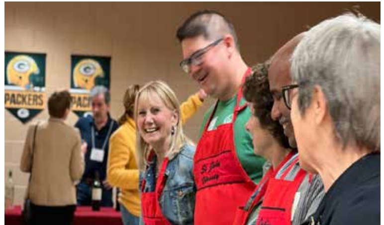
Common Leadership Night fellowship.

Nourish and offer direction to the liturgical aspect of parish life by ensuring that parishioners are provided with opportunities to deepen their faith through a variety of prayer experiences and liturgical celebrations. Offer direction through reflection of readings and seasonal attributes.